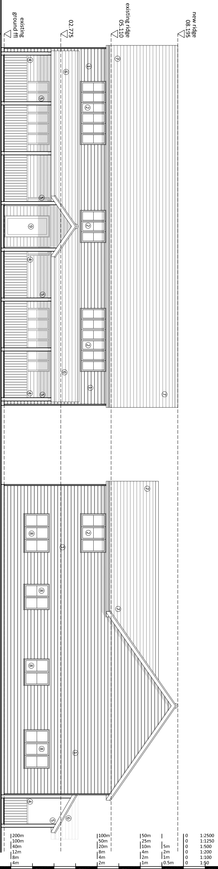
Proposed drawing FRONT ELEVATION